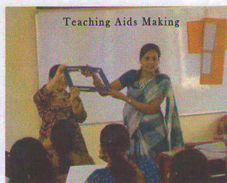
Teaching Aids Making