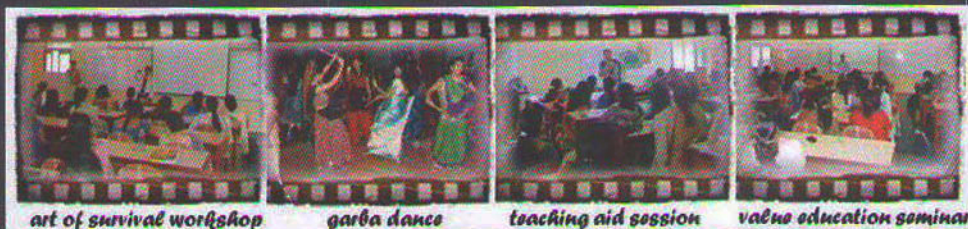
art of survival workshop