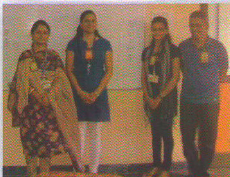
Student Council 2012-13